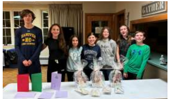
Our youth at the first meeting of the season.